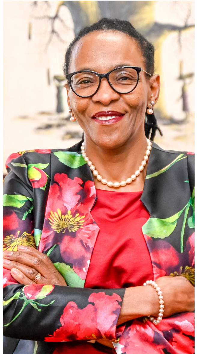
Chief Justice Mandisa Maya

Chief Justice of the Republic of South Africa