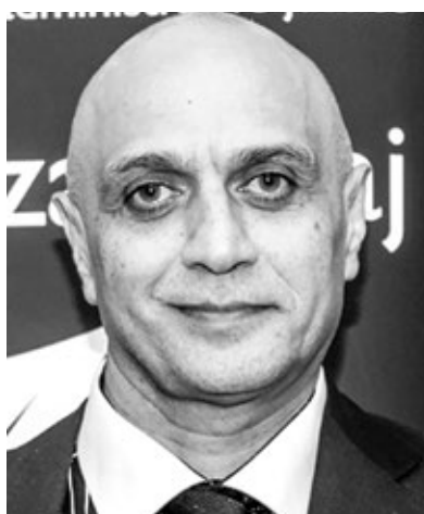
Justice M S Navsa

Supreme Court of Appeal Discharged: 01.06.2022