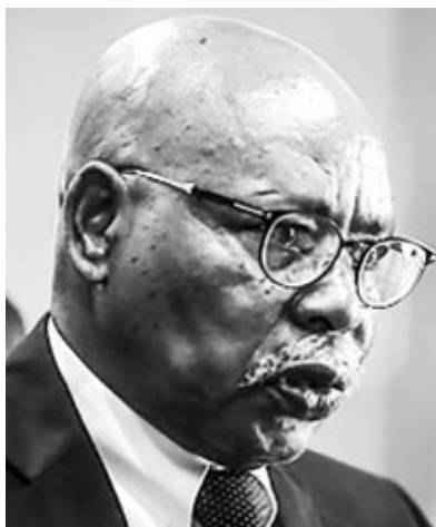
Justice D V Dlodlo

Supreme Court of Appeal Discharged: 04.04.2022