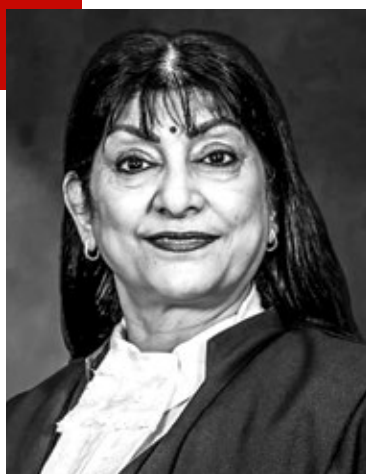
Judge Somaganthie 'Soma' Naidoo (Free State)