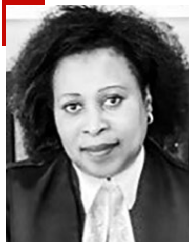
Judge Namhla Thina Siwendu (Johannesburg)