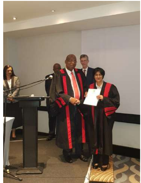
Newly appointed Magistrates for the Durban Cluster and the Area Cluster Heads