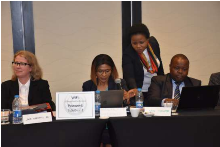
Delegates at the Advanced Aspirant Judges Workshop

The purpose of this workshop was to equip the aspiring Judges on skills to adjudicate all matters in the High Courts. The workshop covered the following topics, namely Constitutional Litigation, Civil Procedure, Management of Criminal Trials, Ethics as well as Judgment Writing.