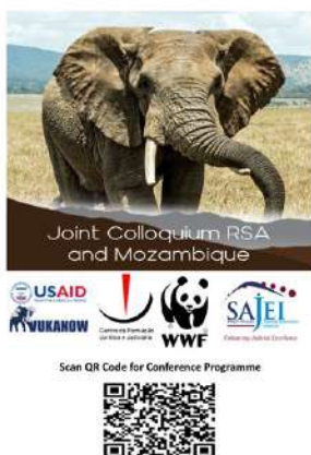
QR Code for the Joint Colloquium RSA and Mozambique Conference Programme