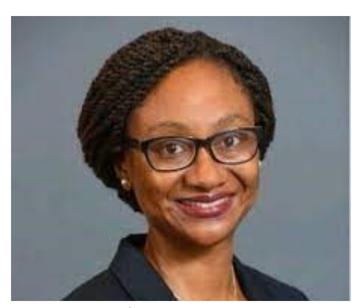
Judge Fiona Mwale<sup>1</sup>