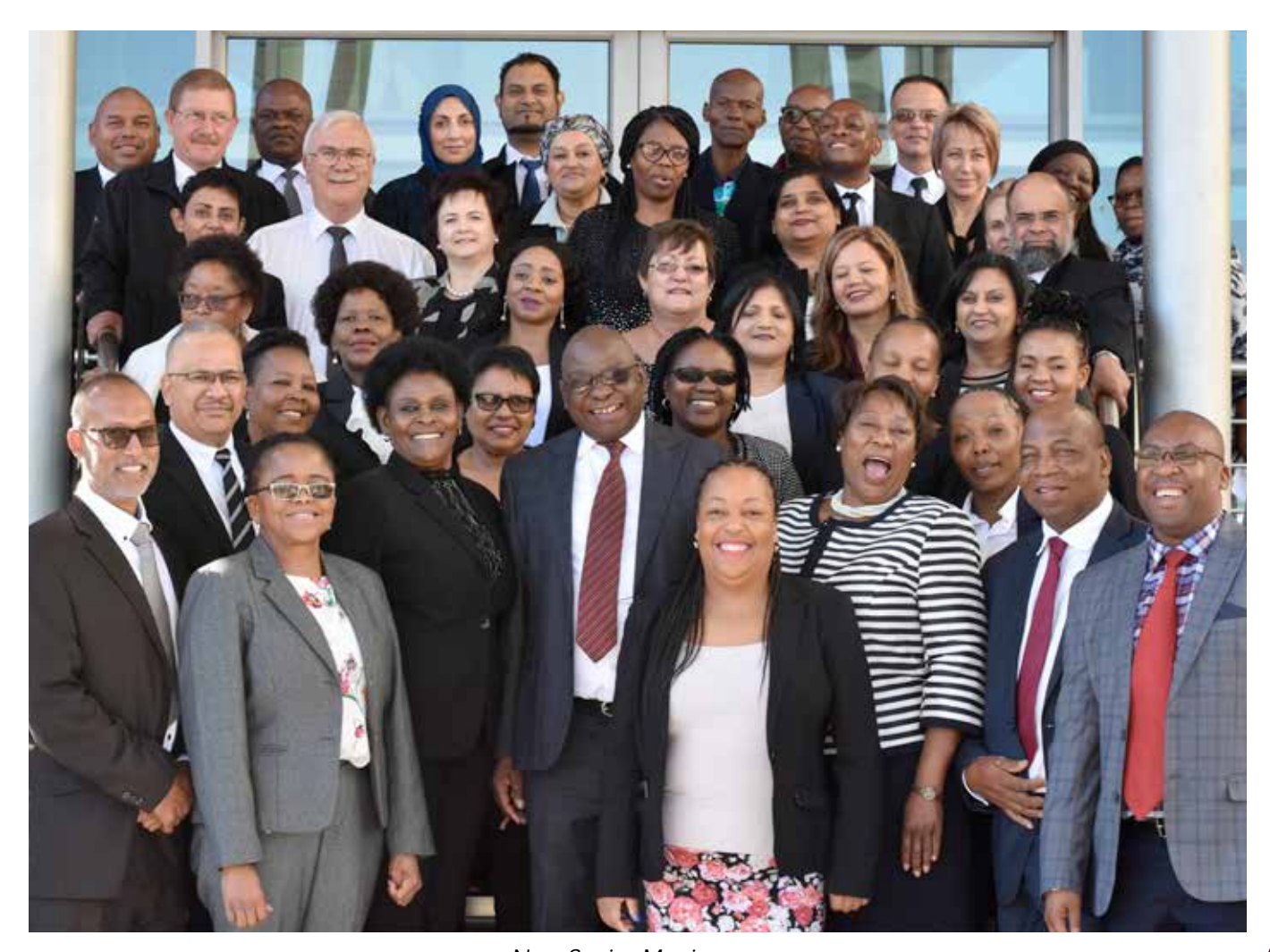
New Senior Magistrates

The Editorial Board has issued a call for papers for the next issue.