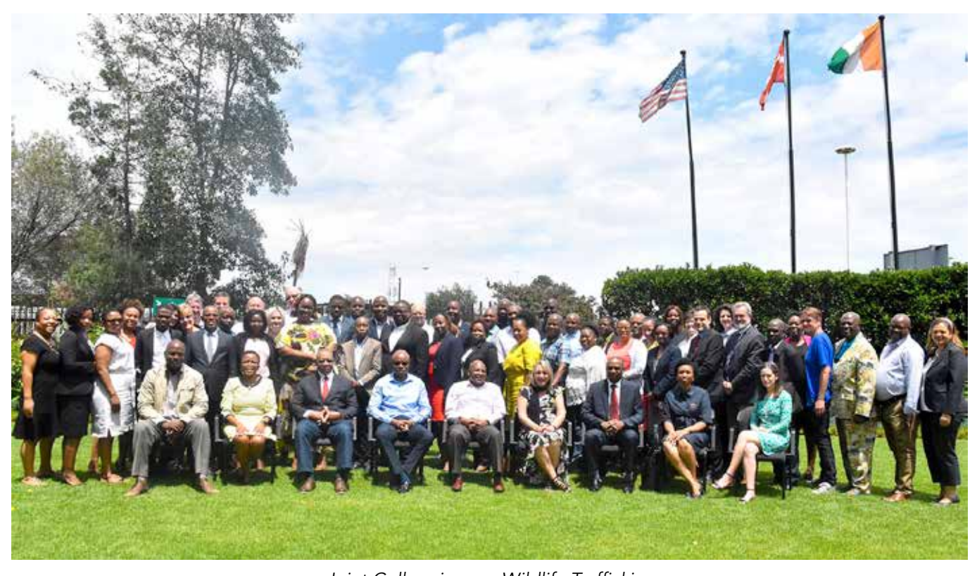
Joint Colloquium on Wildlife Trafficking

Note: Four Judicial Educators are placed at SAJEI for a period of five years effective from 1 September 2016.