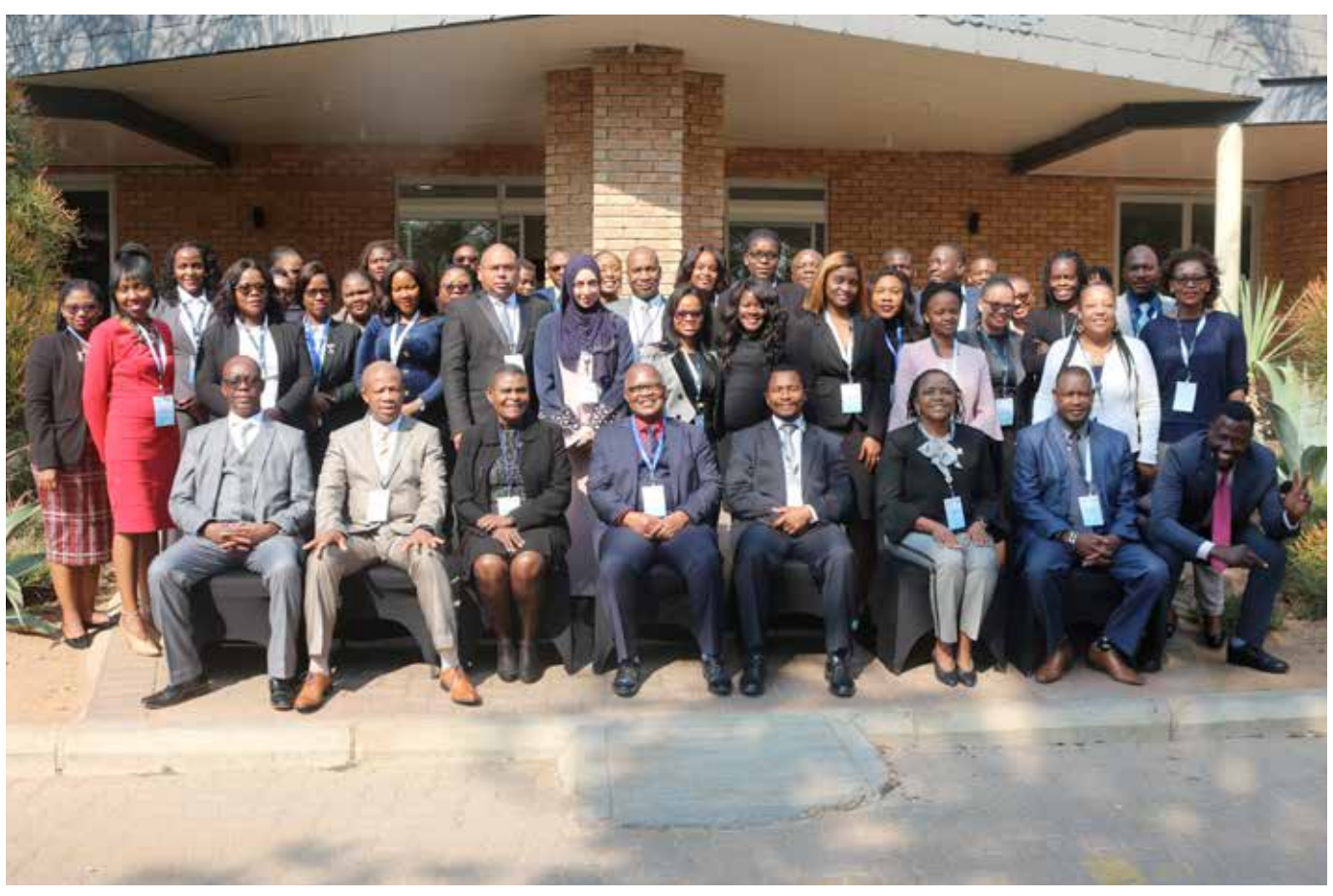
Training of New Magistrates Botswana

The training focused on Civil Court Skills, Criminal Court Skills, Family Court Skills and Judgment Writing. The participants were provided with overnight assignments followed by feedback from the facilitators. From the evaluation feedback, the training was well received.