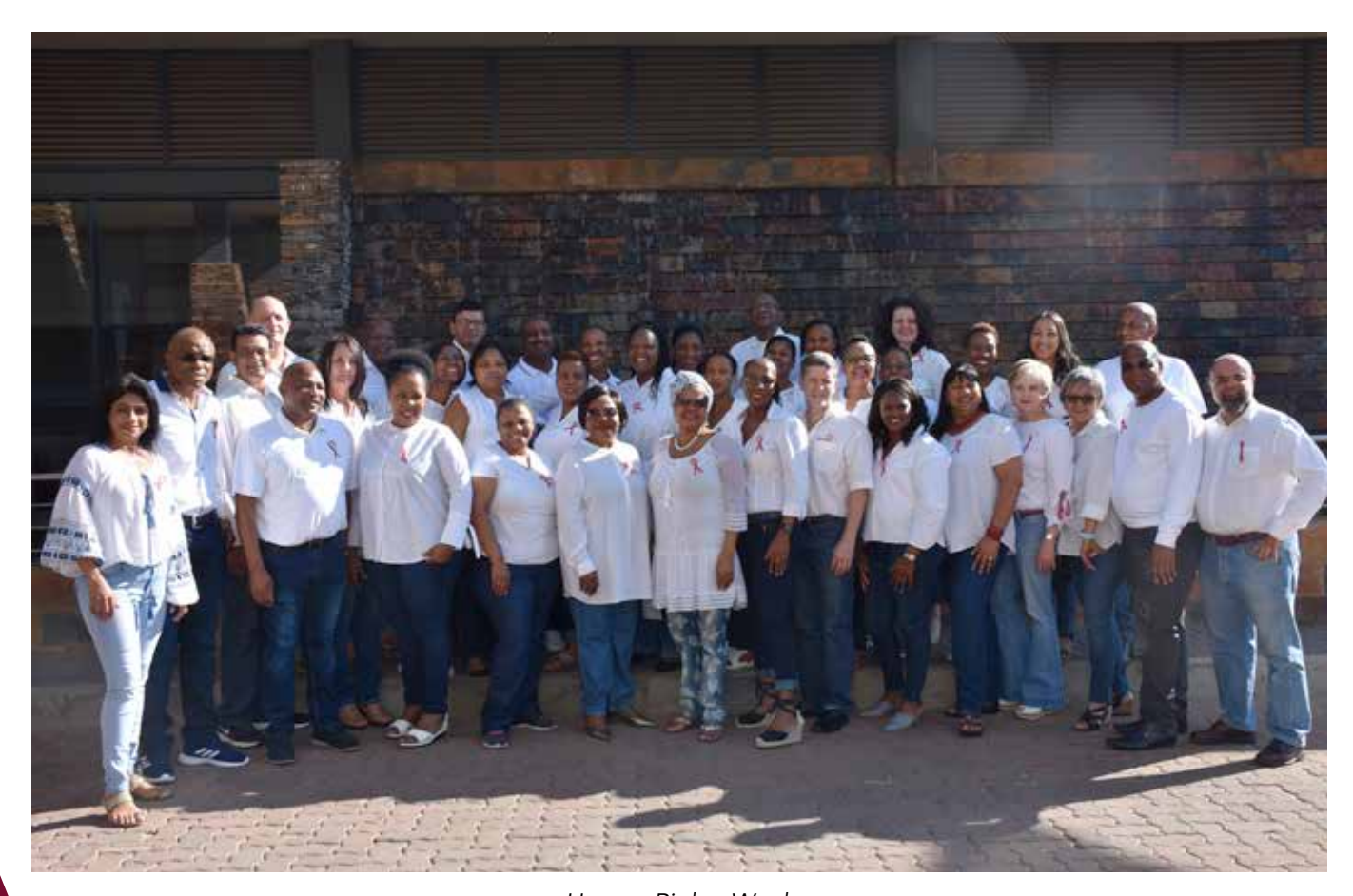
Human Rights Week

The compulsory training of newly-appointed Magistrates is provided for in section 3(1)(f)(i) of the Magistrates (1993). The section provides that: "No person shall be appointed as Magistrates unless he/she has successfully completed an applicable course".