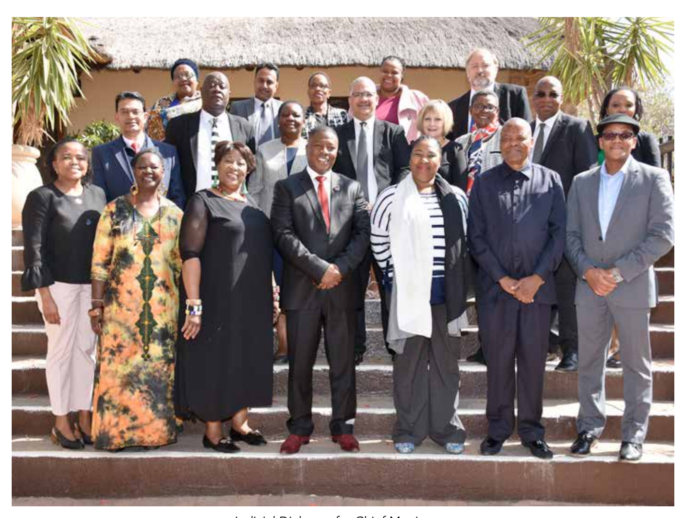
Judicial Dialogue for Chief Magistrates

The second issue of SAJEI Judicial Education Journal was published in December 2019. Finally, for this current financial year three new members were designated to SAJEI Council and they have been inducted.