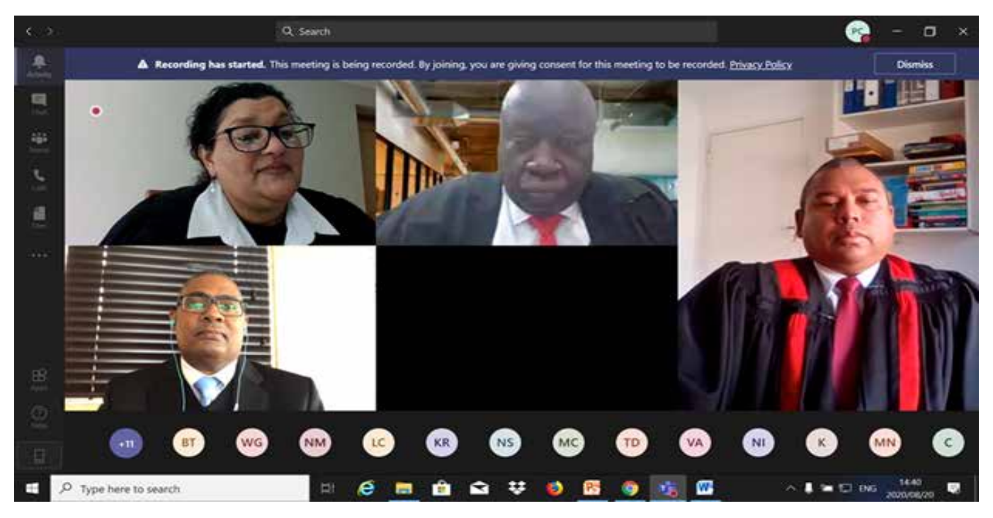
A mock trial under way during a Civil Court Skills Webinar in August, 2020.

The training of District Court Magistrates covered, among others, four (4) streams, namely: Civil Court skills, Children's Court skills, Criminal Court skills and Family Court skills. The training entailed mostly practical components in order to contribute towards Judicial Court performance. For example, mock trials were conducted during Civil Court skills, as reflected in the picture below: