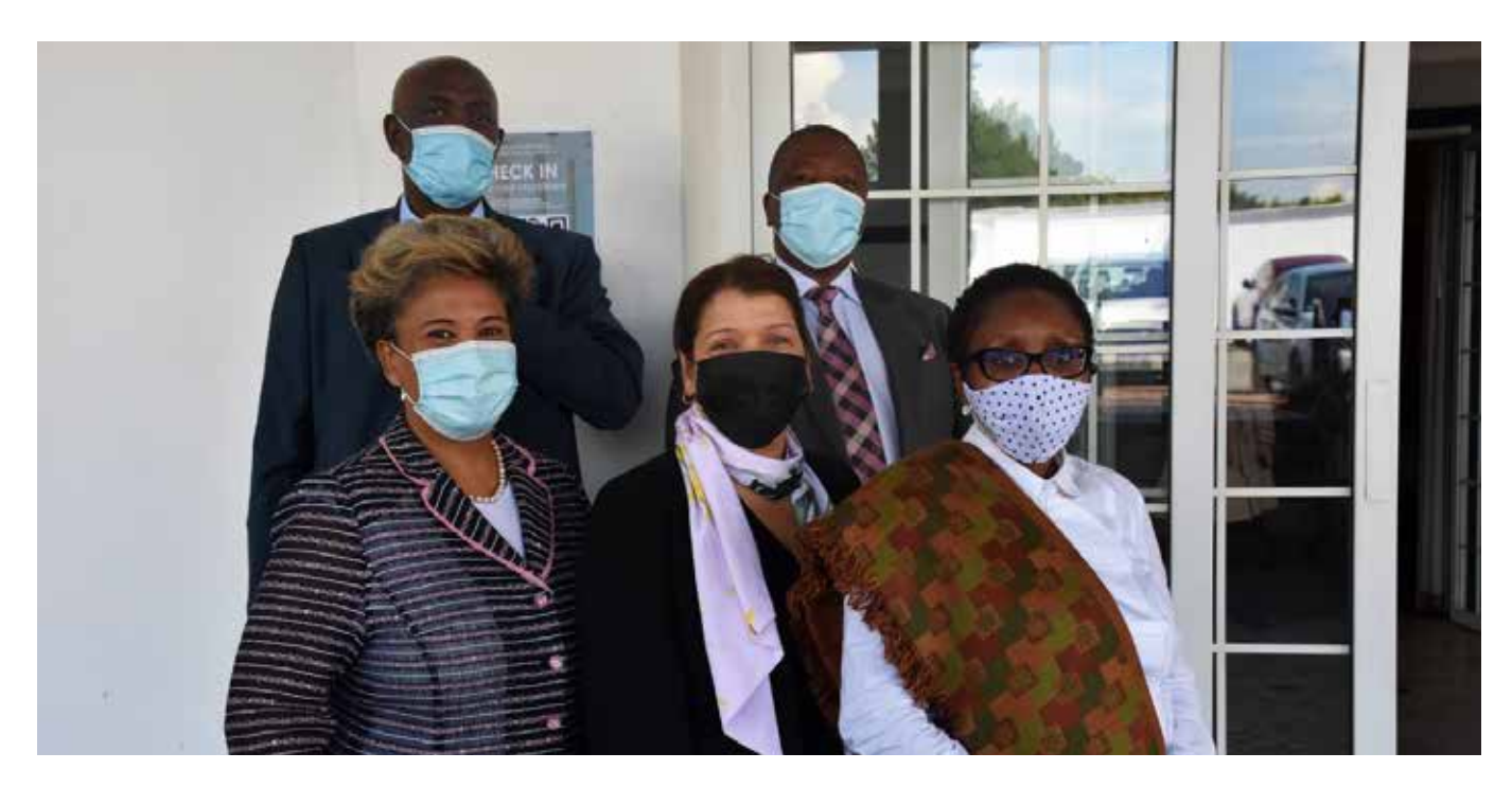
Senior members of the Judiciary and facilitators of the Aspiring Women Judges Programme.

Three (3) webinars were conducted in support to foreign judicial institutions. They were on: trafficking in persons and electoral justice. SAJEI also invited international partners to participate in the webinars. In attendance were members of the judiciary from Botswana, Cameroon, Malawi, Mozambique, Lesotho, Namibia, Sierra Leone, Tanzania, Zambia, Zimbabwe, as well as international delegates from Nevada (USA), Pakistan, Papua New Guinea, Puerto Rico and Singapore.