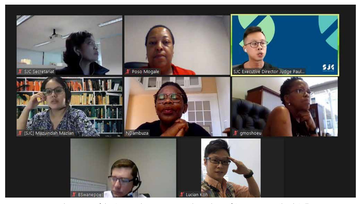
A virtual meeting of the SAJEI sub-committee and members of Singapore's Judicial College.

One of the responsibilities of the institute as stated in the Act, is to "liaise with other judicial education institutions in connection with performance of its functions". In order to improve and refine services rendered by SAJEI, there were consultations with other judicial training institutions around the world for the exchange of best practices. During this reporting period the SAJEI sub-committee of Curriculum Planning and Development engaged with the Singapore Judicial College to, among others, determine an appropriate model for the placement of Judicial Educators at the Institute.