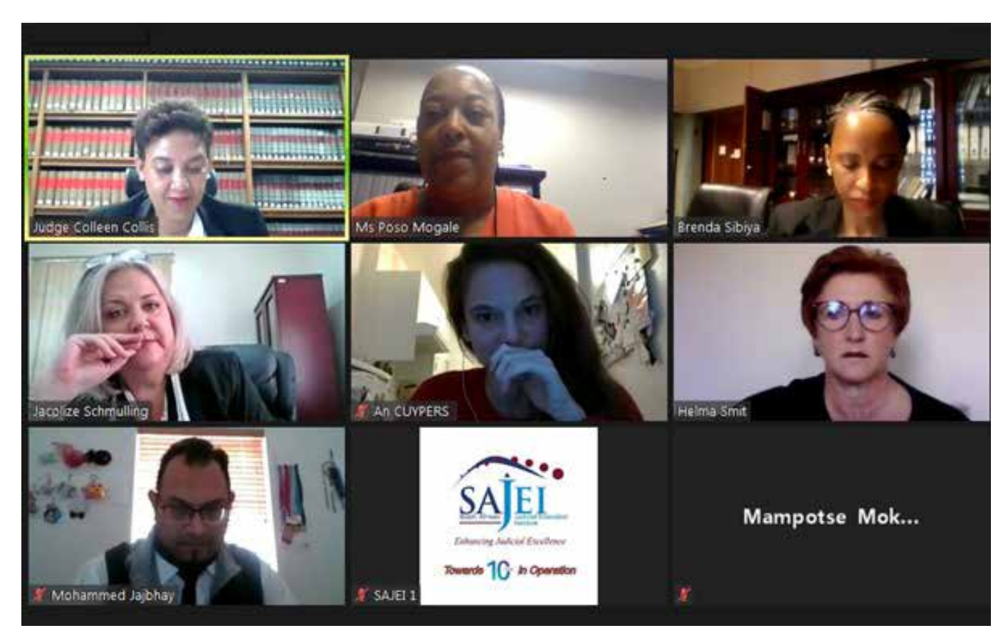
A number of crucial issues were discussed during the 2020 Human Rights Week.

Two webinars took place in June 2020 for Regional Court Magistrates and members of the Judiciary from foreign institutions. One of the webinars was on managing judicial training in new normal times in order to share experiences, and build capacity. The webinar was organised in partnership with the National Centre for State Courts in USA. Other training initiatives focused on gender-based violence and stereotyping, evictions, trafficking in persons, sexual offences, PEPUDA, the Small Claims Court, child pornography, PAIA and PAJA.